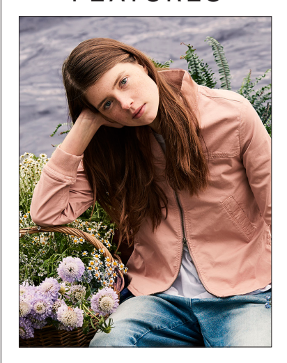
20 FASHION: April Edit