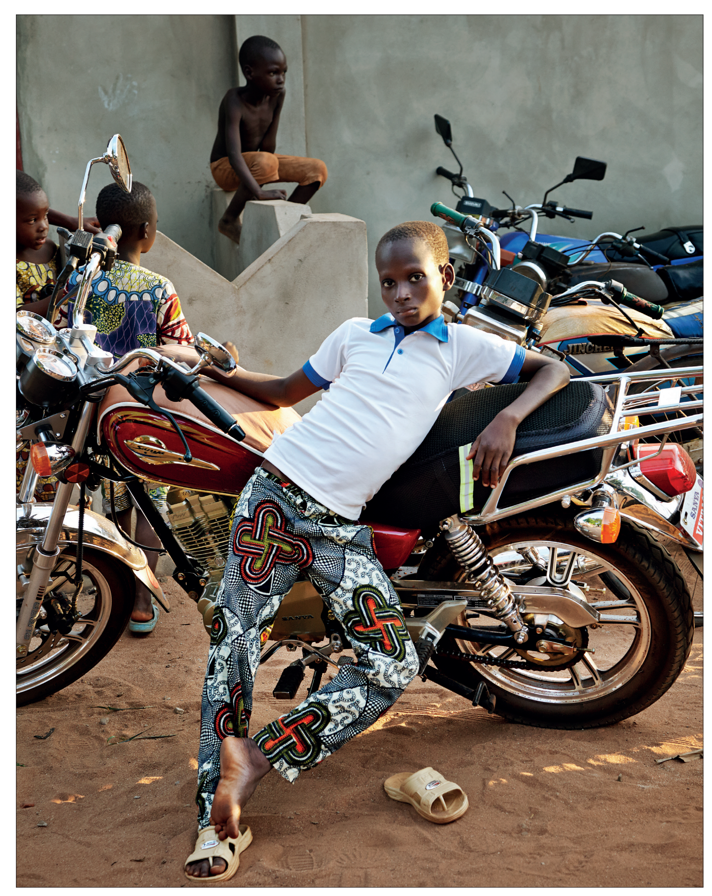
Circadian Landscape, by Jessica Antola, is published by Damiani, priced £29.

19) BEAUTY 20) FASHION 28) INTERIORS 31) CHEF 32) EATING OUT AND DRINK 34) GARDENING 35) OUTDOORS 36) TRAVEL 46) DRIVE 52) TELEVISION